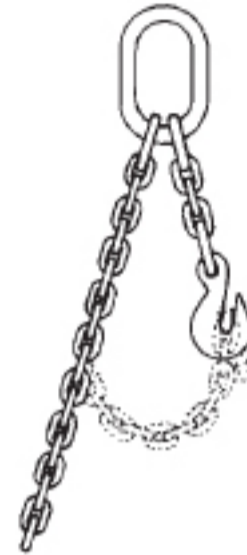
Style B Standard with 1 foot of chain in short leg.